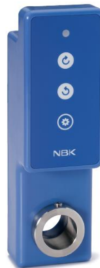
[Successor Products] EPU-220-A-BL

* The housing will not change. Discontinued products and their successors can be distinguished by the part number listed on the nameplate on the side of the unit.