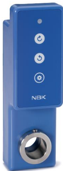
[Discontinued Products] EPU-200-W5-R60

Thank you for your cooperation and understanding.